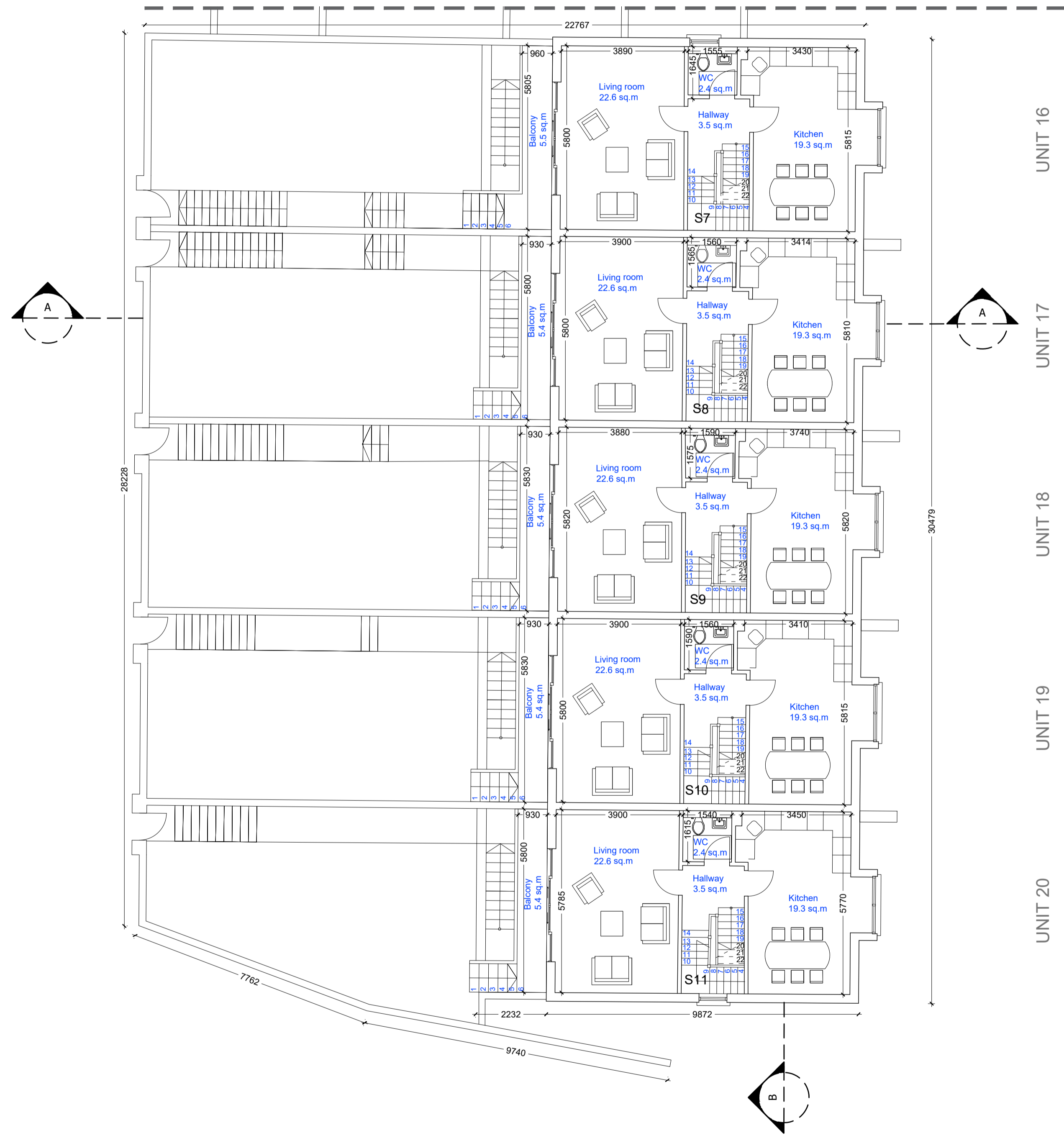
BLOCK D - PROPOSED FIRST FLOOR PLAN 1:100@A1